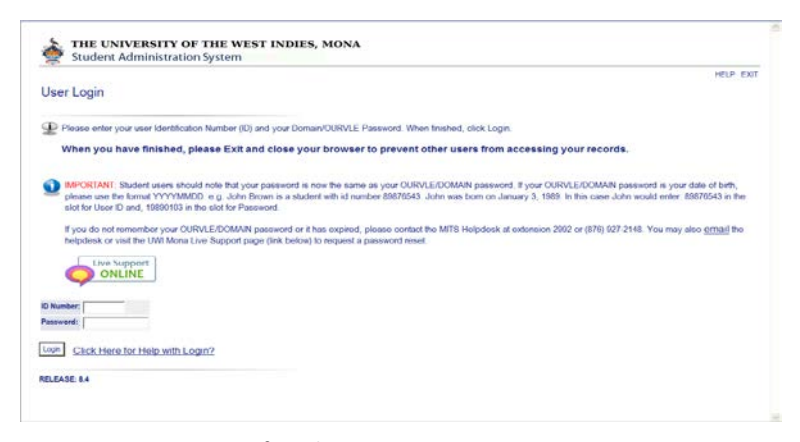
Screen view of SAS login page