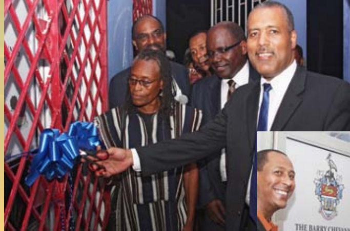
Official opening of the Barry Chevannes Fathers Inc. Resource Centre