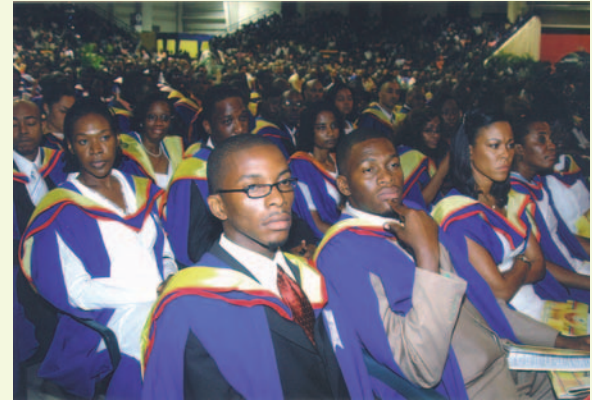
Proud graduates in rapt attention

TWO THOUSAND ONE HUNDRED AND FIFTY TWO GRADUATES SATISFIED THE REQUIREMENTS FOR THE AWARD OF FIRST DEGREES; 185 CANDIDATES WERE AWARDED DIPLOMAS AND CERTIFICATES, 680 MASTER'S DEGREES, 27 PHDS AND 33DMs FORTY-FOUR PER CENT OF THE FIRST DEGREES WERE IN THE FIRST-CLASS OR UPPER SECOND-CLASS CATEGORY