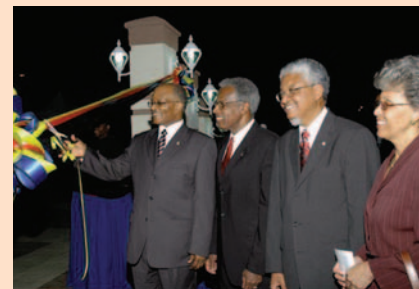
Above: G-G, Chancellor, VC and Principal declare the Founders' Park open