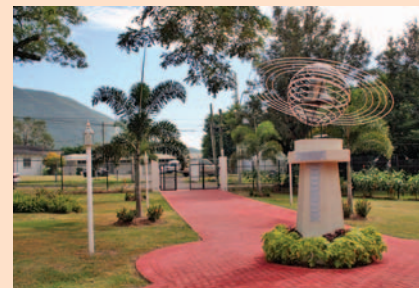
Below: The park dedicated to UWI Graduates who became heads of governments

◀ Left : Principal of the Mona Campus, 1996–2006, Professor the Honorable Kenneth O. Hall became the 5th Governor General of Jamaica in February 2006.