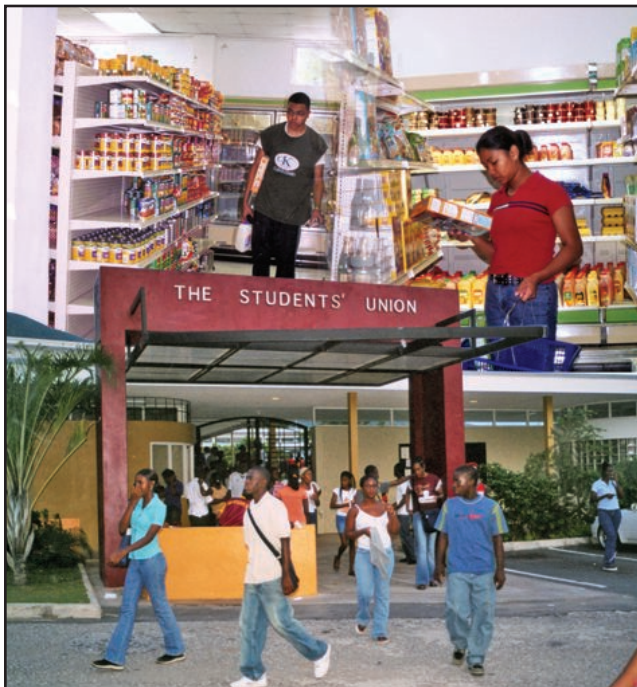
1. Students shopping at the new mini mart facility, which opened at the Students' Union complex.

The 2002/2003 period saw additional initiatives of the Business Development Office to introduce and evaluate the potential for introducing new income-generating concerns. It completed the commercial centre, and identified suitable tenants to operate the mix of businesses required, such as a mini mart, food outlet, unisex beauty salon and travel agency. During the year leases were signed with Hi-Lo Foods Ltd. to establish and operate the Mini Mart and with VIHOPE Ltd for the food outlet. The terms and conditions for the lease