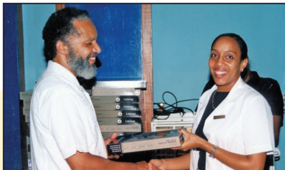
The Medical Alumni Association donates stethoscopes to medical students

It is well recognized worldwide that alumni support is critical to a university's long-term sustainability. Concerted effort was made during the academic period to strengthen alumni support. The UWI Alumni Association (UWIAA) set about updating alumni contact information; and establishing and making available through the UWIAA "Great Things for UWI" programme, an e-mail directory of alumni.