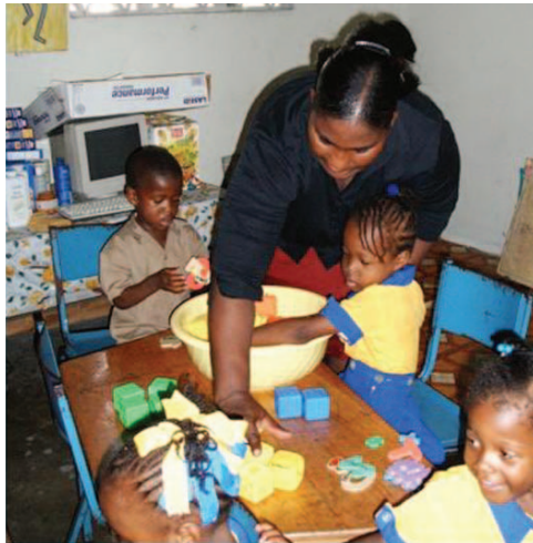
A teacher and three year old children at Regent Street SDA Basic School.

This research project seeks to implement a programme promoting young children's social and emotional competence to reduce the level of aggression in basic schools, and to identify how the programme can be integrated into early childhood institutions in a sustainable way. It involves tailoring, implementing and evaluating a theoretically-based, empirically validated intervention into basic schools in urban areas of Kingston and St Andrew. Five basic schools have been randomly assigned to an intervention or a no-intervention group. Intervention will take place from November, 2006 to May, 2007 and comprises two main components: