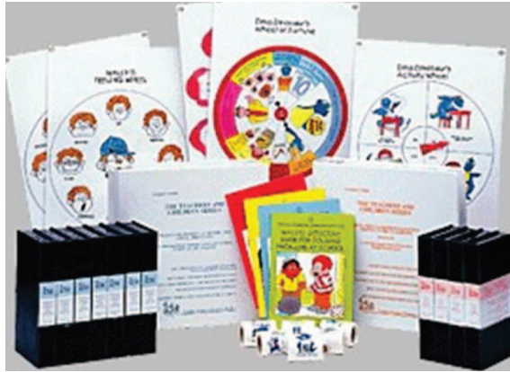
Materials use in the teacher training workshops

appropriate for the Jamaican basic school setting. Parental involvement is promoted through both the child and teacher training curricula and in addition monthly parent workshops will be held.