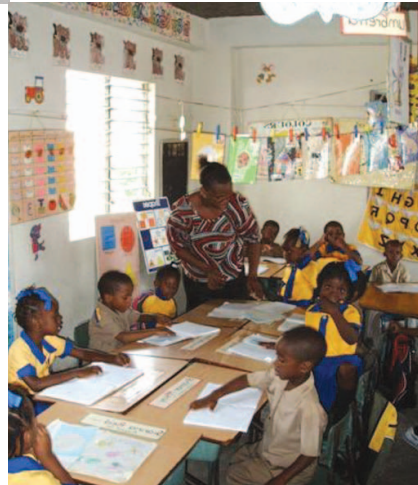
Four year old children at Regent Street SDA Basic School.

In addition to support received under the Mona Research Fellowship Programme, this project is being funded by the Environmental Foundation of Jamaica and UNICEF, Jamaica. It is a collaborative effort with the Child Development