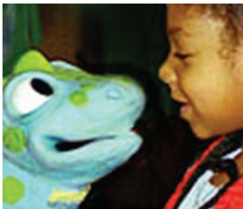
A child with Dina Dinosaur (a puppet used to teach concepts to the children).

The most proximal causes of antisocial behaviour are ineffective parenting, poor teacher-child relationships, poor home school bonding and peer rejection at school. The proposed intervention addresses each of these root causes at a strategic developmental period. Early childhood institutions reach over 97% of 4-6 year old Jamaican children and hence this intervention has the potential for near universal coverage and ongoing sustainability.