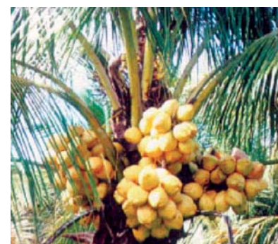
Malayan Dwarf Coconuts

Lethal Yellowing (LY) is a fatal disease of coconuts and other palms and has killed millions of plants in the Caribbean over the past 40 years. The sudden emergence of the phytoplasma related disease in coconuts and their rapid spread have caused much concern, especially because they have reached such epidemic proportions throughout Jamaica. To date the vector of the phytoplasma responsible for the spread of LY disease in Jamaica is still not known. Information is needed on the potential vector(s) and inoculum sources to predict the risk of new infections, to monitor disease progress and to develop control methods. The overall aim of this ongoing research project therefore is to study insect fauna associated with coconut and their potential as vectors for the transmission of lethal yellowing disease affecting coconuts.