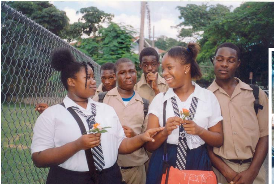
The relationships young adolescents have with their peers and adults are important in determining their outcome as adults

The information coming from this survey contributes significantly to the emerging body of literature that links birth factors with later childhood and adult outcomes of health, development and behaviour. Recommendations for Health and Education policies are being formulated.