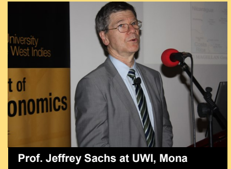
Prof. Jeffrey Sachs at UWI, Mona

On Wednesday May 7th Prof. Jeffrey Sachs gave a public lecture to about 300 persons from the university community and the wider public. The public lecture, organized by Department of Economics, and the Institute for Sustainable Development - the UWI Mona, focused on sustainable development in the Caribbean. Earlier in the day Prof. Sachs was the main speaker at the launch of the Caribbean chapter of the Sustainable Development Solutions Network (SDSN). The Caribbean SDSN is headquartered at the UWI Mona.